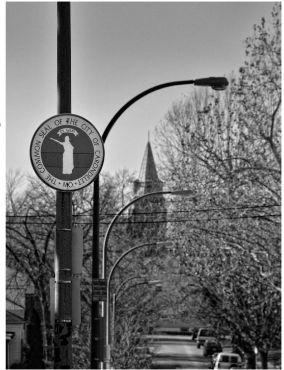
The steeple of St. Trinity Church, home to Resurrection Presbyterian, as seen from Vermont Avenue.

You can find out more about Resurrection by visiting their website at www.rpcstl.org or by visiting them on Sundays at 11:00 a.m. They meet at St. Trinity Lutheran Church -- 7404 Vermont in Carondelet